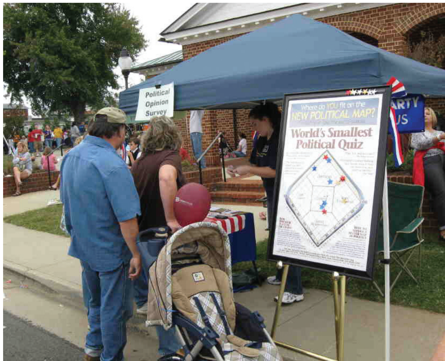
Libertarians from Lynchburg, VA, host an outreach event at the Appomattox Railroad Festival.