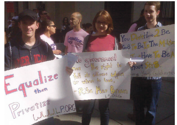
Libertarian interns attend D.C. Equality March.

Instead of urging the government to grant same-sex couples the same benefits as heterosexual married couples, the Libertarian Party advocates for zero government intervention in personal relationships with the goal of privatizing marriage. Libertarians maintain that as long as the government has the power to distribute marriage licenses, it has the power to define marriage itself. Therefore, the only way to preserve the greatest amount of freedom for members of the LGBT community is to regard marriage and other personal relationships as private social contracts, eliminating the special benefits that are assigned to the government sanctioned institution. The government should not treat married people differently from unmarried people.