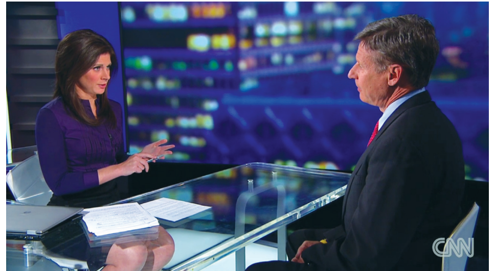
Libertarian Party Presidential Nominee Gary Johnson sits down with CNN's Erin Burnett to discuss his 2012 campaign to defeat Mitt Romney and Barack Obama.