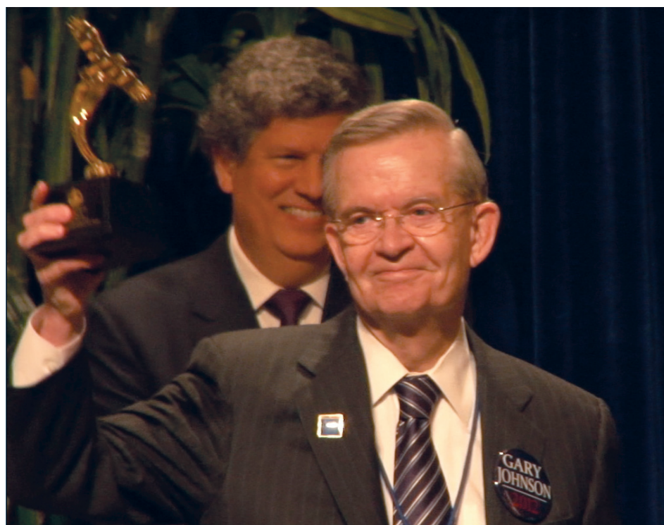
Ed Clark, the Libertarian Party's third presidential candidate (1980), accepts the "Hall of Liberty" award.

The THOMAS PAINE Communication Award was presented to the LP member who has been an outstanding com-