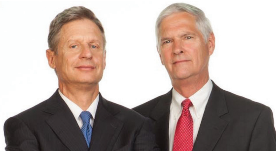
The Libertarian Party elected former two-term New Mexico Governor Gary Johnson (left) as its presidential candidate for the 2012 election. Judge Jim Gray (right), a veteran trial judge in California, was elected Vice President.

While left largely intact, some important changes were made to the party's bylaws and platform.