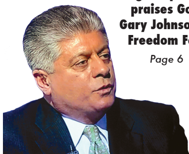
Judge Napolitano praises Gov. Gary Johnson at Freedom Fest