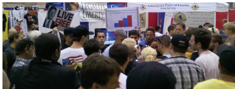
Supporters were still waiting for a chance to meet Gov. Gary Johnson 1-1/2 hour after he spoke at at the PAUL Festival in Tampa.

"How can I get a yard sign?" asked hundreds of visitors who passed through