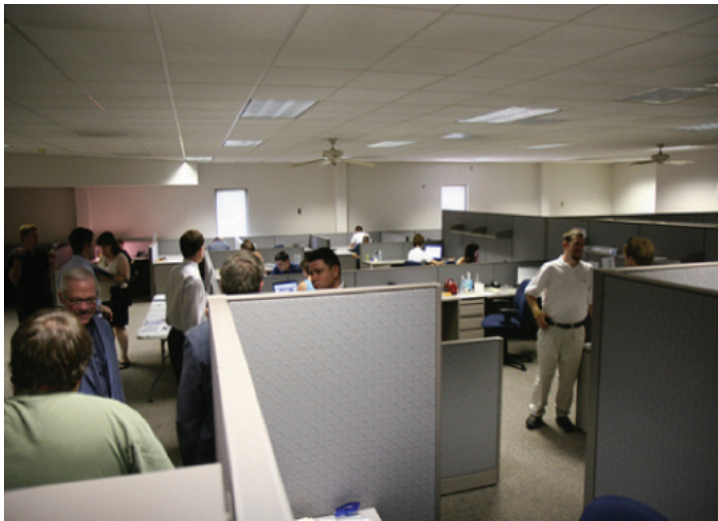
August 8, 2008: Barr - Root 2008 Staff and Volunteers Hard At Work at Campaign Headquarters on Volunteer Day

Office hours: 9 am-6 pm ET New Member Information: Call (800) ELECT-US E-mail: info@lp.org