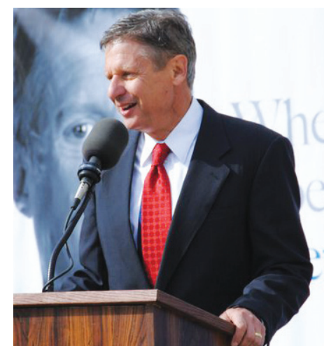
Gov. Gary Johnson

These election results are especially impressive in light of the dramatic advantages awarded the LP's Democratic and Republican opponents.