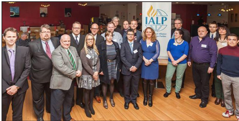
Representatives of Libertarian Parties from the United States, the United Kingdom, Belgium, France, Germany, Spain, Switzerland, the Czech Republic, The Netherlands, and Poland met in Bournemouth, UK, for the founding of IALP.