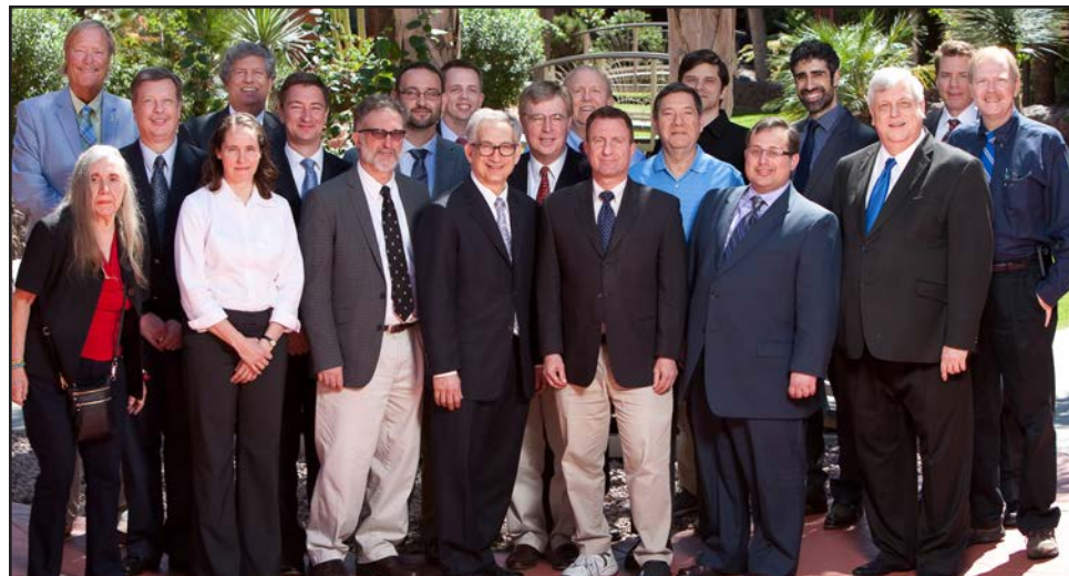
Libertarian National Committee officers and representatives met in Phoenix, Ariz., March 28–29.

The LNC created an advisory Ballot Access Committee to supplement the hard work of our regular activists. The committee's key tasks are to collect, analyze, and report information, but the LNC still retains decision mak-